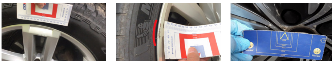
Charges applicable to over 50mm. Image 2 shows 40mm which is within tolerance.