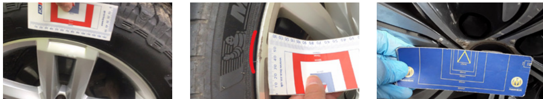
Charges applicable to over 50mm. Image 2 shows 40mm which is within tolerance.