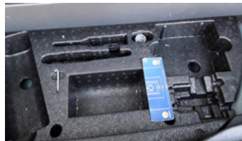
In the above image the tyre inflator is missing.